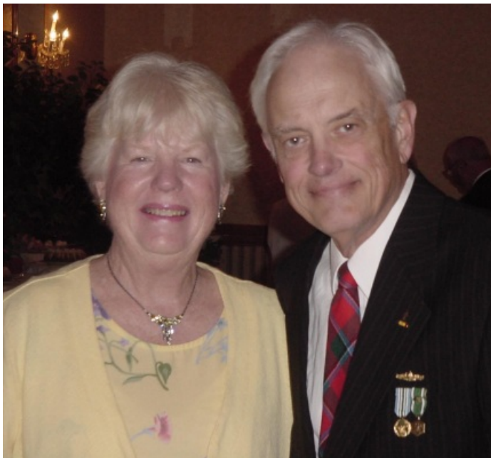
USS MADDOX (DD-731) REUNION