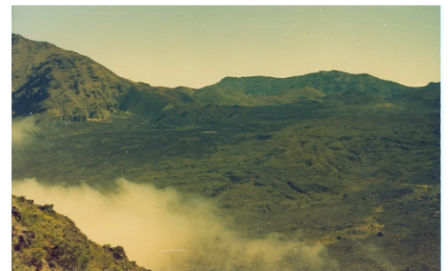
HALEAKALA CRATER FROM RIM, IN SHADOW