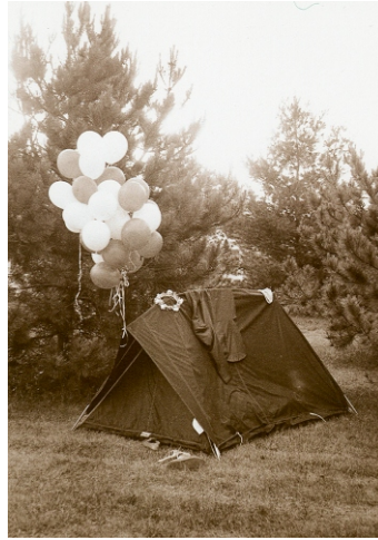
“Honeymoon Suite”