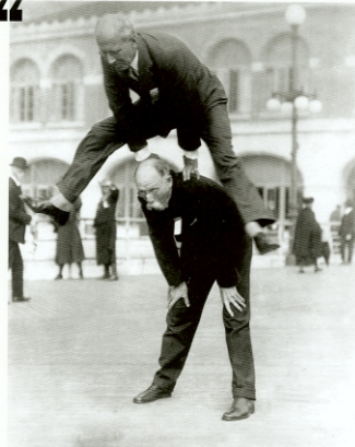
Age is a question of mind over matter. If you don't mind, it doesn't matter. Leroy (Satchel) Paige (1906–1982)