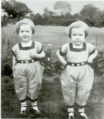
I base most of my fashion taste on what doesn't itch. Gilda Radner (1946–1989)