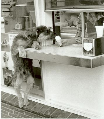
When people care for you they can straighten out your soul. Langston Hughes (1902 – 1967)