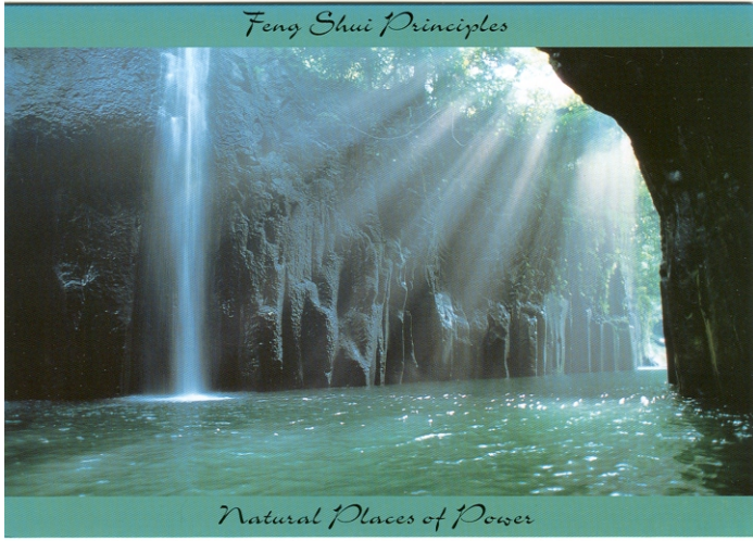
Text (c) Tom Bender Feng Shui Principles cards, FS 2701