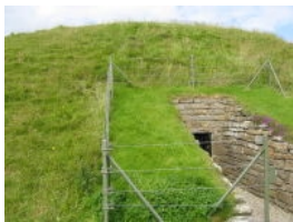
WEST ENTRANCE, SUN ENTERS AT SOLSTICE SUNSET.