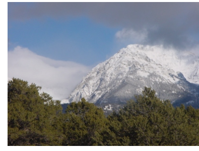
VIEW OF THE SAN LUIS VALLEY BELOW (VALLEY FLOOR AT ABOUT 8000 FT ABOVE SEA LEVEL. MOUNTAIN CRESTS AT ABOUT 16,000 FEET.