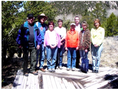
GROUP AT THE "UNICORN MEADOW"