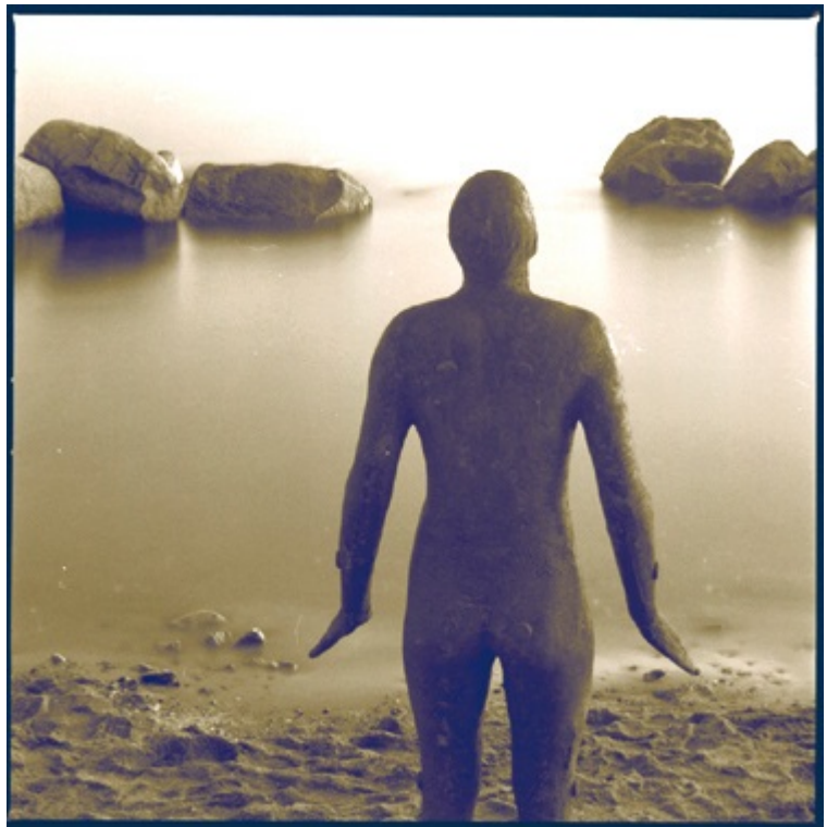
SCULPTOR ANTONY GORMLEY: "HAVMANNI" SCULPTURE AT MO I RANA, NORWAY.